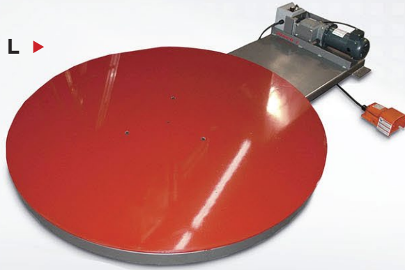
ROCKET L ▶