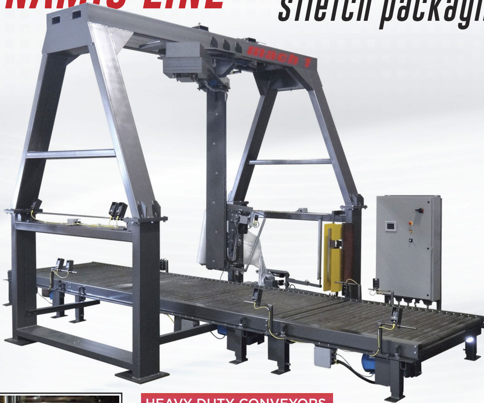
◀ DYNAMIC RTX